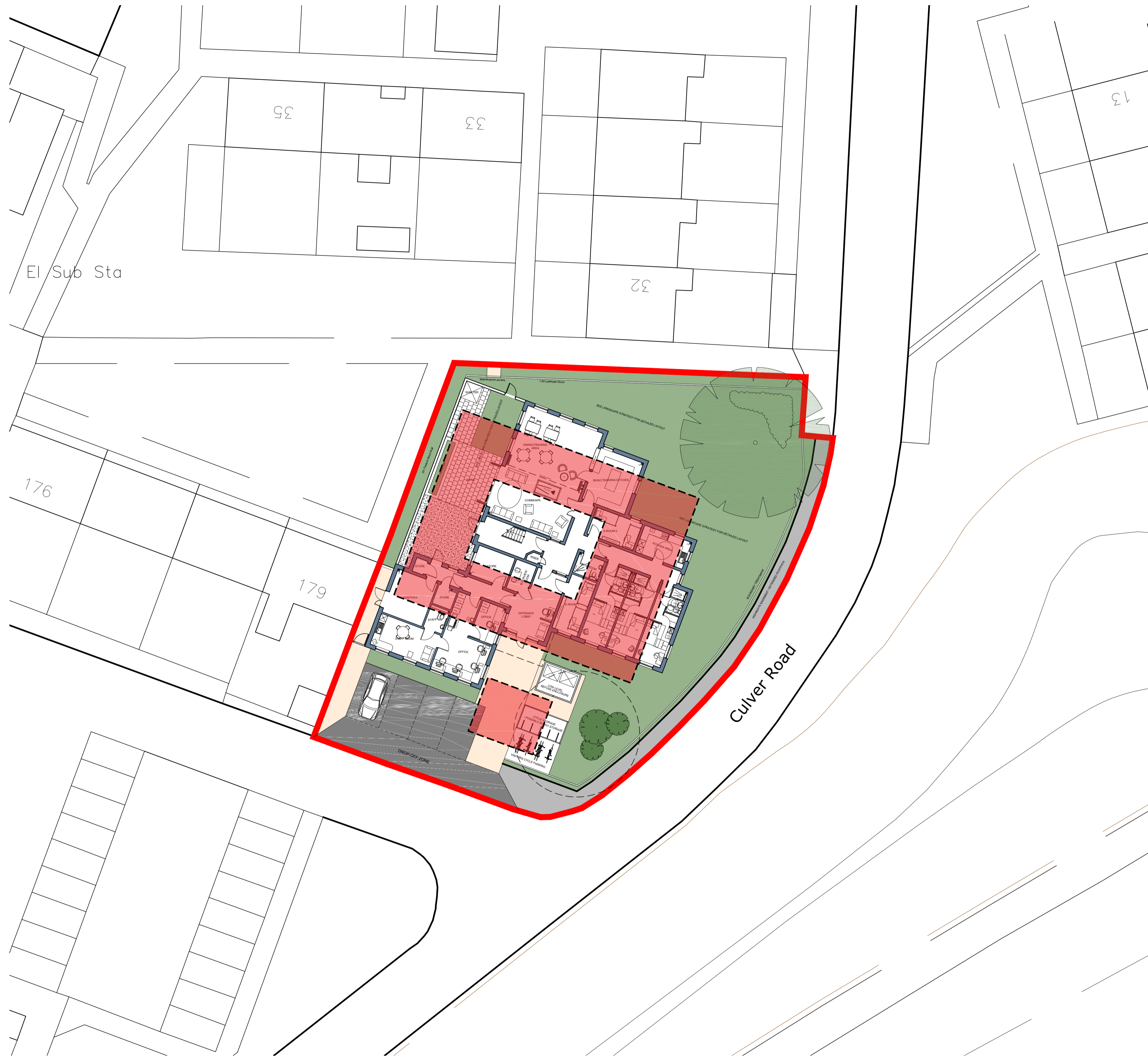
SITE PLAN Scale 1:200

GENERAL NOTES: 1. This drawing is the copyright of KSA Architects Ltd and may not be copied, altered or reproduced in any form or passed on to a third party without written consent. If in doubt ASK. 2. The drawing reflects current standards and legislation agreed for this project at the time of original issue.